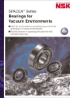
CAT. No. E1227