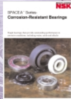
CAT. No. E1228