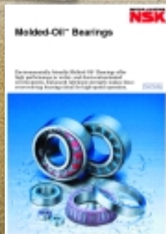
CAT. No. E1216