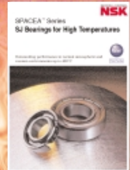
CAT. No. E1223