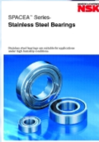
CAT. No. E1231