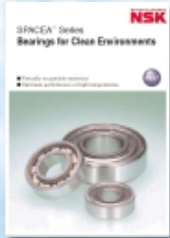
CAT. No. E1229